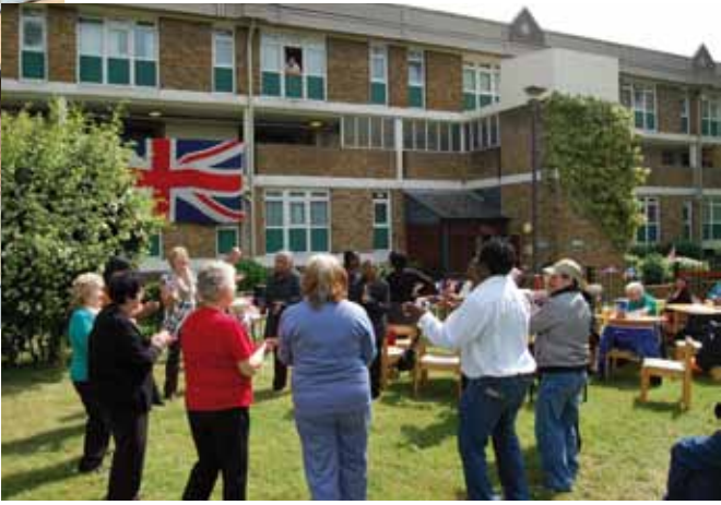
We arranged a special older persons' tea party to celebrate the Queen's Diamond Jubilee.