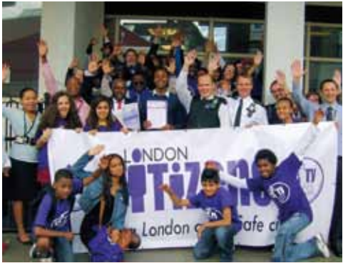
The CTH Housing Office was the first in London to be made a Safe Haven.